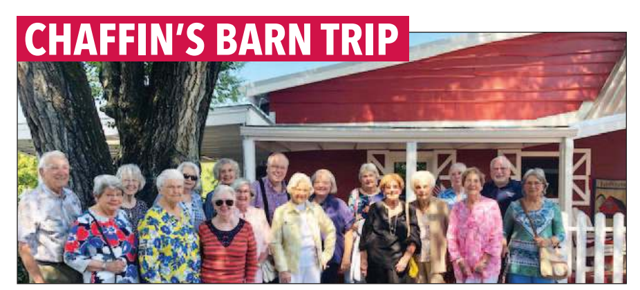
We took in a performance of the comedy, "Southern Fried Nuptials" at Chaffin's Barn Theater. A delicious lunch, great fellowship and lots of laughs were enjoyed by all. We'll go back in the fall to see "Singin' in the Rain.

After the tour, we'll head to Puckett's Grocery on the square in Columbia for a delicious, dutch-treat lunch.