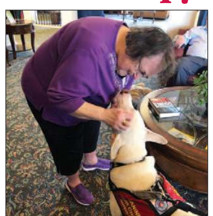
Canines for Christ visit on the fourth Friday of each month at 1:00 p.m. for Pet Therapy. Stop by and love on some sweet dogs to brighten your day! It's been proven that spending time with pets increases your quality of life.