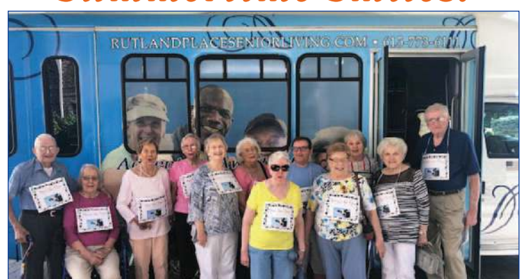
Our residents were a big hit at the Mt. Juliet Chick-Fil-A for Cow Appreciation Day!