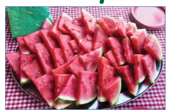
There's nothing like good cold watermelon to cool you off on a hot summer day!