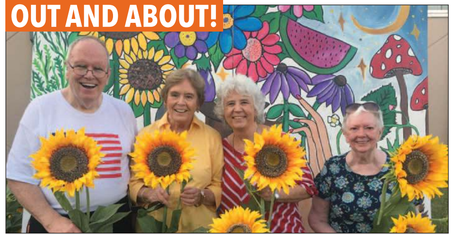
Everyone was all smiles at the Wilson County Fair!