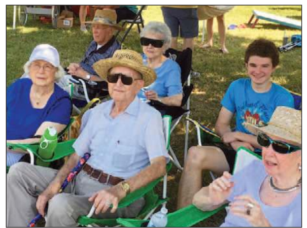
It was hot but fun at Celebrate Mt. Juliet Day. Residents enjoyed listening to Little Texas perform.