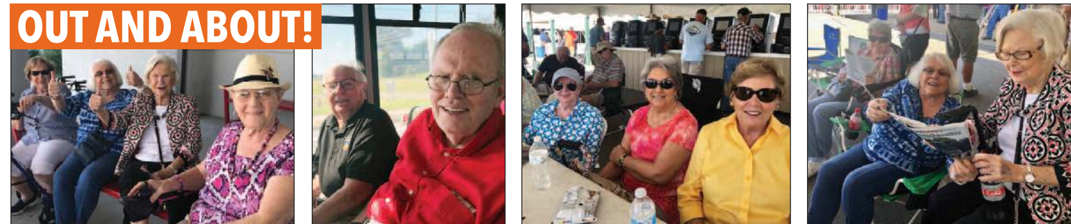
It was a beautiful day to head to Kentucky Downs for the horse races. We may not have “won big” but everyone had a great time!