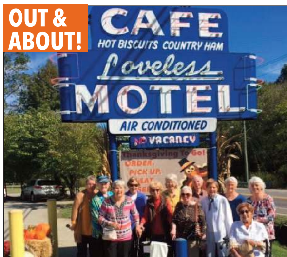
It was a beautiful trip to the famous Loveless Café

October's Italy Night brought families together and lots of smiles from residents!