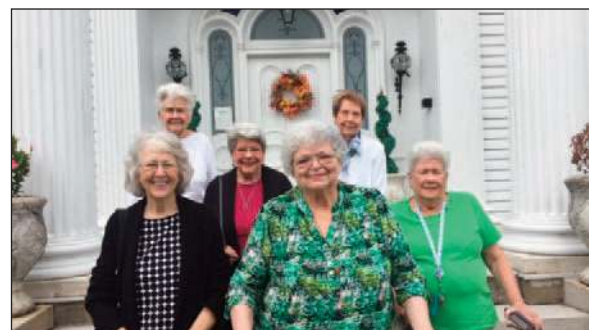
The Monthaven Art and Cultural Center