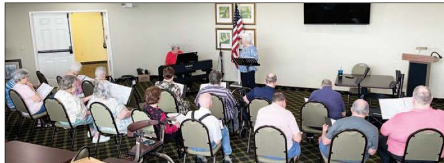
Our Joy singers preparing for their Independence Day performance