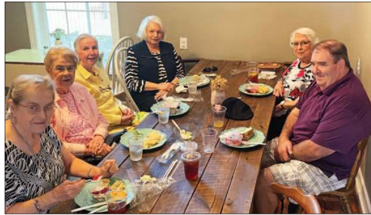
Our group enjoyed eating lunch out at the Wildberry Cafe!