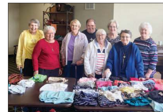
A big thank you to our Busy Hands group for helping on our Donation Day! They kept everyone and everything organized. We couldn’t have done it without you!