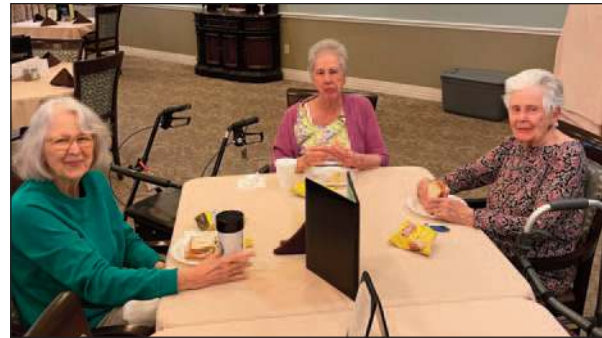
Our picnic on the Patio was rained out. That didn't stop residents from enjoying the sandwiches inside!