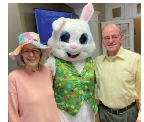
Although treasuring the true meaning of Easter, we still had some fun with the Easter Bunny!