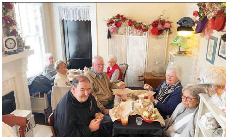
Residents enjoying our lunch outing at the Sassy Pecan Restaurant! This month, our meal outings include Demo’s, and Cracker Barrel. We’ll also sample the catfish, chicken and shrimp fried in peanut oil, plus steaks, in homey digs with rocking chairs at Cock of the Walk.

Please check the calendar for times and sign up in advance for all outings.