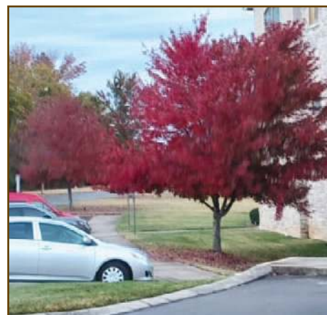
The beauty of fall at Rutland Place!