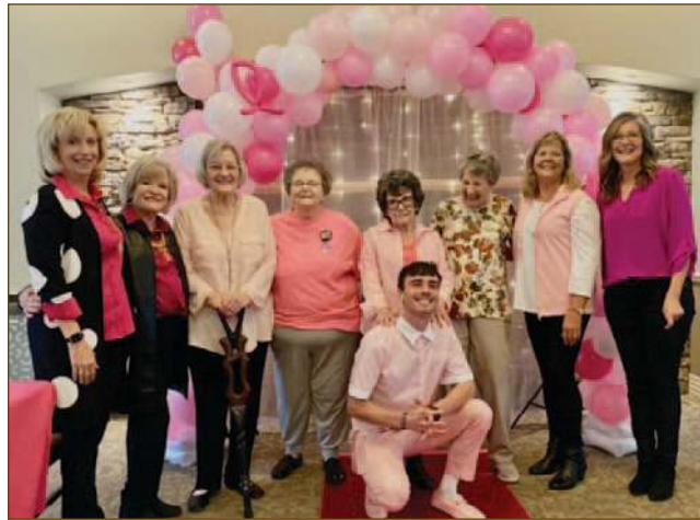
Thank you to Chico's of Mount Juliet for pampering our breast cancer survivors and helping us honor them!