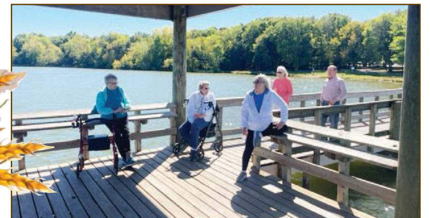
We visited Long Hunter state park for a fall picnic!