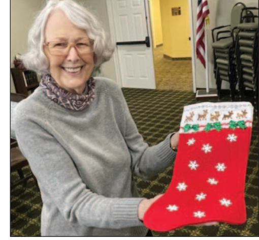
We were fortunate to visit the Tennessee Residence along with all the fabulous happenings right here at home!