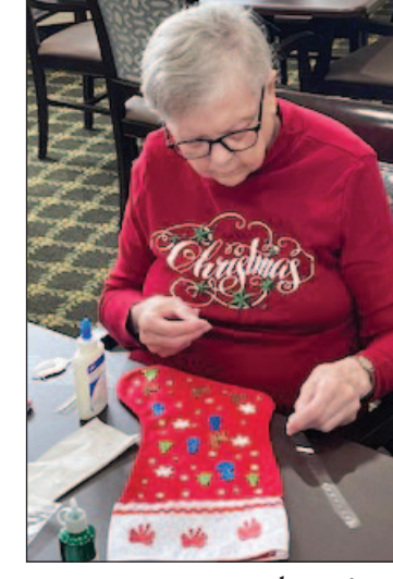
We got into the Christmas spirit decorating our own stockings!

Hourly Staff at the Resident and Staff breakfast. Thank you to all staff and residents who attended. It is awesome to have everyone in the Rutland Family together! It doesn't happen often.