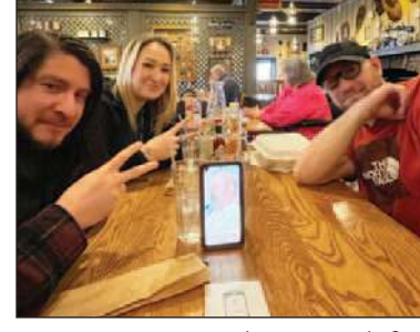
Our trip to Cracker Barrel for breakfast. We were also excited to see the maintenance crew there