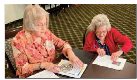
Update day! Residents help one another update the directories as new residents join our community!