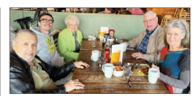
Breakfast outing at First Watch