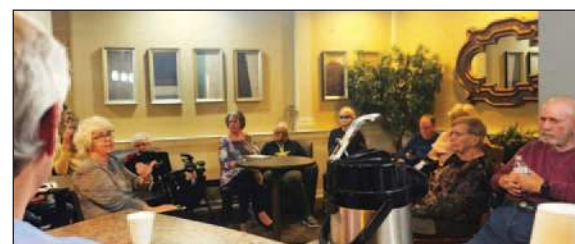
The first Food Committee meeting of 2024 was well attended.