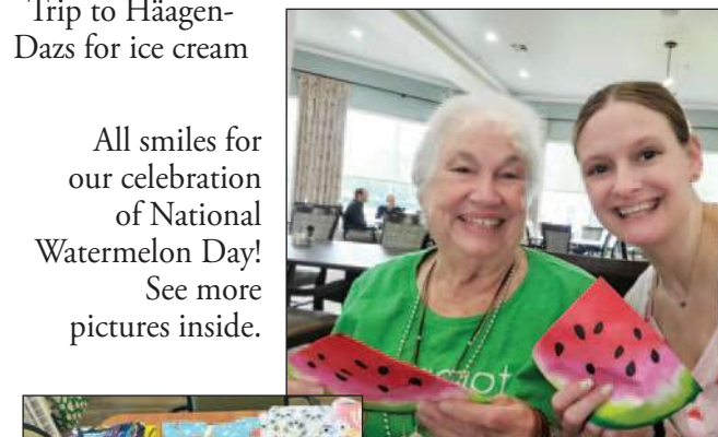
All smiles for our celebration of National Watermelon Day! See more pictures inside.