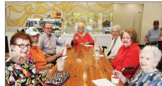
Trip to Häagen-Dazs for ice cream