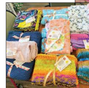
Lap and baby blankets for Vanderbilt Hospital and Vanderbilt Children's Hospital. Our "Busy Hands" group has been very busy!