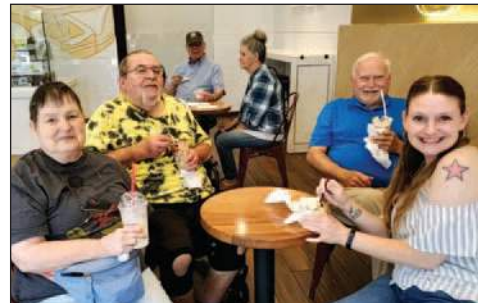
Out for ice cream and dinner